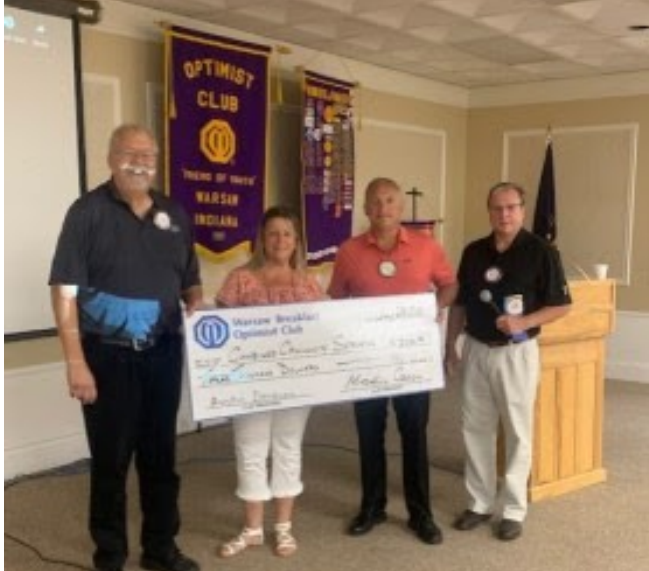
From: Warsaw Breakfast Optimist Club Check presentation to CCS for School Supplies and Backpacks