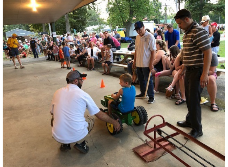
The Bluffton Optimist Club held its annual 4-H Fair Kiddie Tractor Pull to a large crowd of on-lookers. The kids were divided into different weight categories. There were 72 participants.