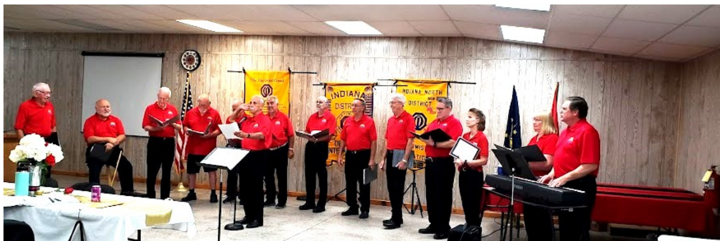
The Warsaw Club's own choir entertained us.