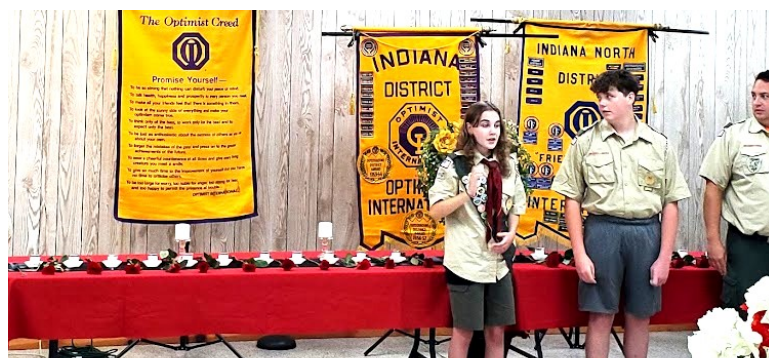
Members of a local Boy Scout troop presented the Flag in a color guard ceremony.