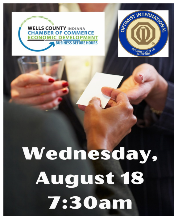
The Bluffton Club teamed up with the local Chamber of Commerce for an early morning Meet & Greet WOW meeting.