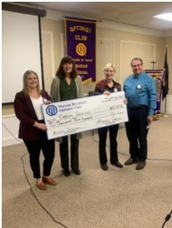
Warsaw Breakfast donates $2,500 to Cardinal Center

Want to see your Club's activities in the District News Letter? Email information to Jim.