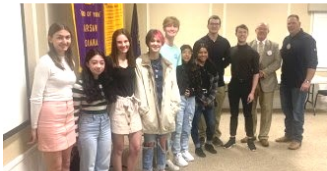
Warsaw Community High School Students of the Week