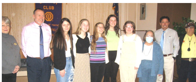
Chesterfield Essay and Oratorical Contest Winners