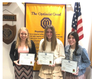
Bluffton Opti- mist Club Essay and Oratorical Contest Winners.