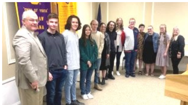
Warsaw Area Career Center Students of the Week