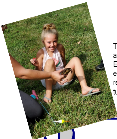
The Decatur Optimist Club held a Fishing Derby along with the Eagle's Lodge. There were 46 entrants. One entrant was not real thrilled with her catch of a turtle.