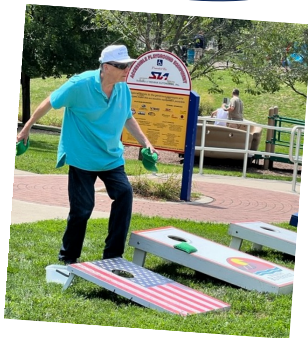
Cornhole contest held by the Lafayette Noon Club.