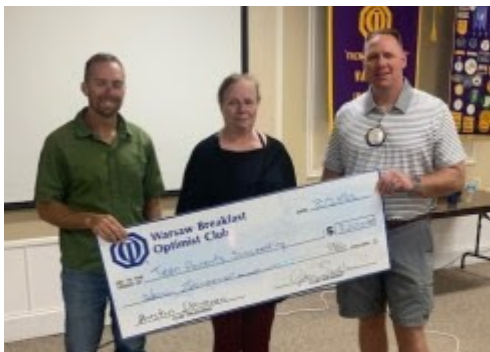
The Warsaw Breakfast Club presented a $3,000 check to Teen Parents