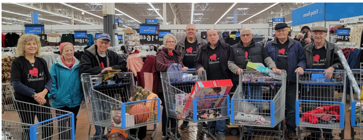
The Decatur Optimist Club Christmas shopped at Walmart for 10 kids. They purchased clothes and toys for all. The names were supplied by Love INC