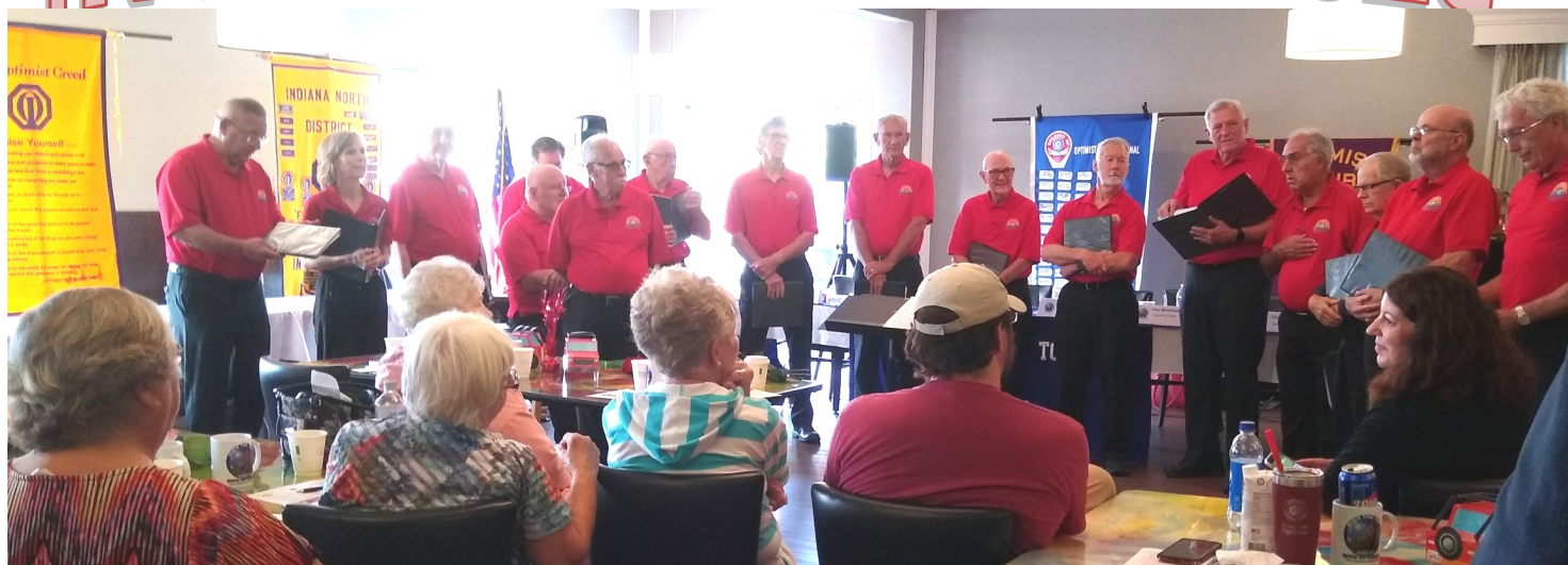
The choir from the Warsaw breakfast Club. WOW!! What a performance.