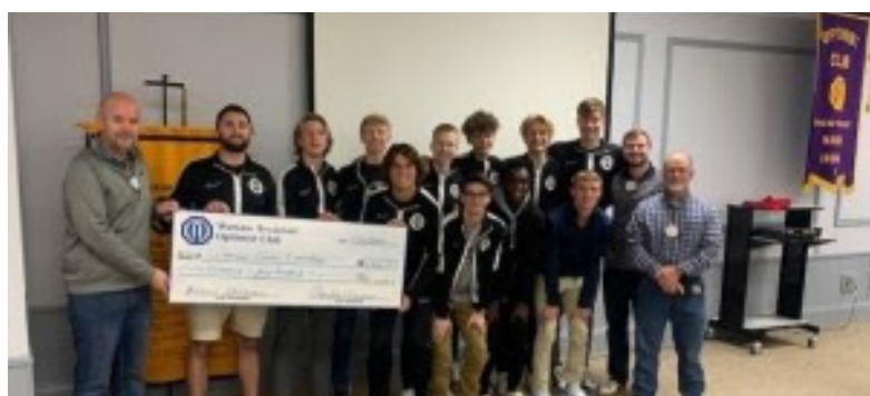
$1,500 Check presentation to the WCHS Cross Country Team