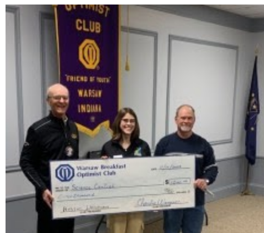
Warsaw Breakfast Club makes a $1,000 donation to Science Central.