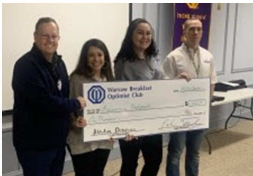
Warsaw Breakfast Optimist presents check to Boomerang BackPacks